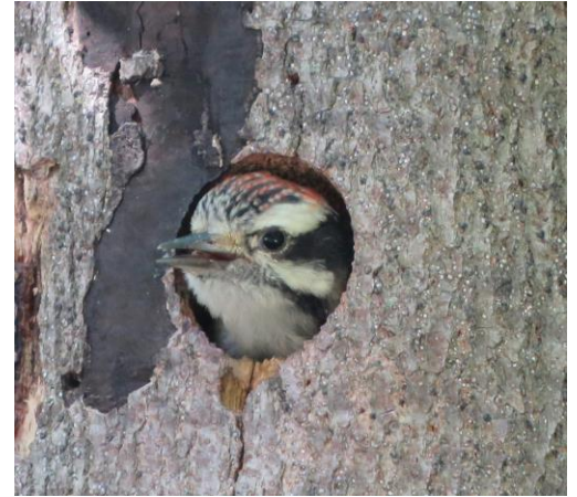
Red-Bellied Woodpecker chick