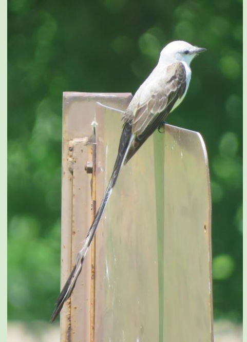
Scissor Tailed Flycatcher